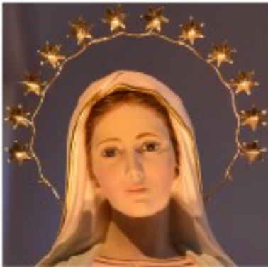
Our Lady of Tihaljina

Son more deeply. Join us on a pilgrimage to this miraculous place.