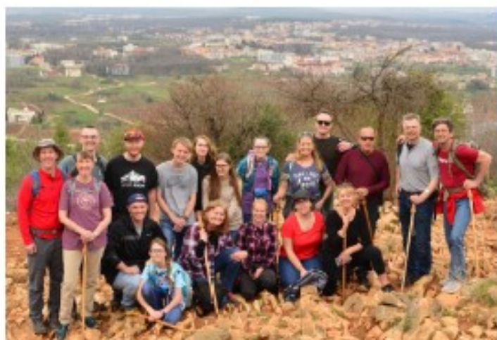
Climb Apparition Hill

* Cost is an estimate, per person, based on double occupancy (limited single occupancy available for additional cost). Cost will vary to match actual incurred costs. Travel insurance not included, but is recommended.