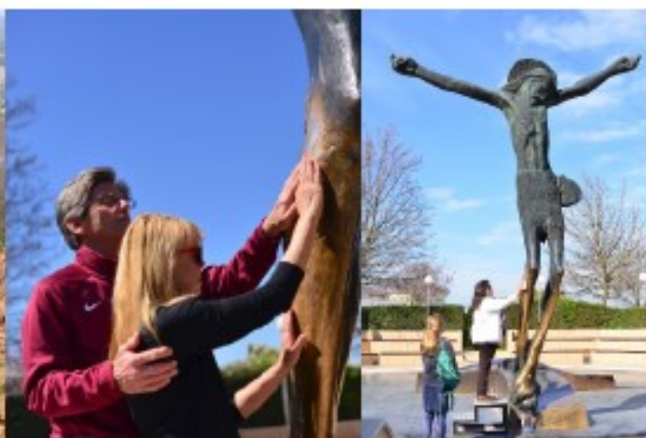
Visit the miraculous Statue of the Risen Christ

"If you knew how much I love you, you'd cry for joy!"