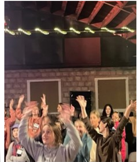
Fidelis Retreat 10/29/22

Night 4 Catholic World View: Jan.11, 2023