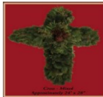
Cross - Mixed Approximately 24" x 28"