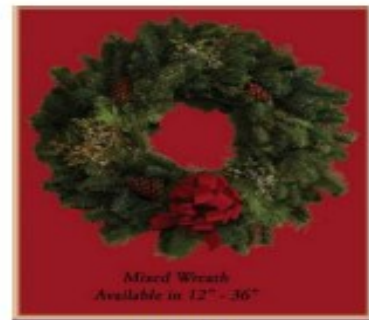
Mixed Wreath Available in 12" - 36"