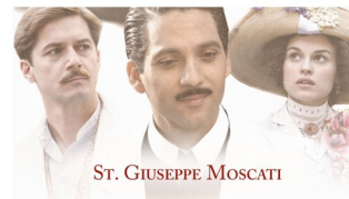
ST. GIUSEPPE MOSCATI

Giuseppe Moscati, "the holy physician of Naples," as a medical doctor and layman in the early twentieth century who came from an aristocratic family and devoted his medical career to serving the poor. His research also led to the discovery of insulin as a cure for diabetes. Moscati regarded his medical practice as a lay apostolate, a ministry to his suffering fellowmen. Before examining a patient or engaging in research, he would place himself in the presence of God. He encouraged his patients to receive the sacraments.