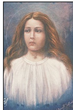
Saint Maria Goretti

www.rcahybrid.org provides a classical, hybrid education in the Catholic tradition for Pre K3- 12th grade students. Lesson plans for home days are included and optimized for in-home education.