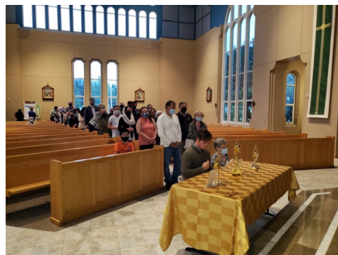
Veneration and Line in the Church