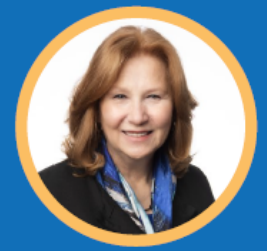
Mayor Anne McEnery-Ogle City of Vancouver